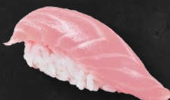
WAHOO | $3.25