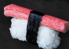
IMITATION KRAB | $2.95