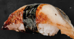
EEL | $4.25