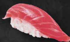
TUNA | $3.25