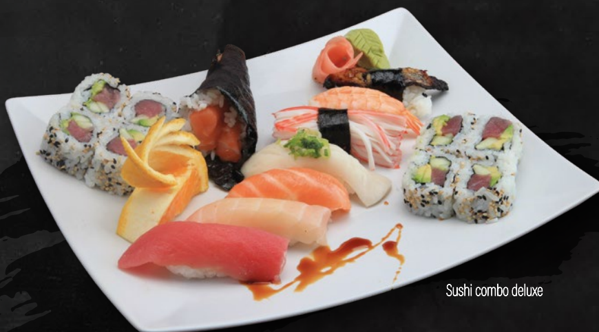
Sushi combo deluxe

10 pieces of sushi, 1/2 California Roll with masago, and 1 hand roll.