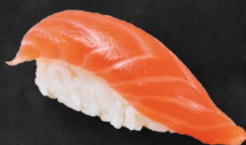
SALMON | $3.25